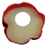
Latex Neck Seal P/N 6412-NP

All Training PBE Devices are also available for purchase on our eStore.