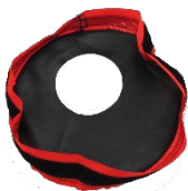
Non-Latex Neck Seal P/N 6412-001

Accessories are available for the training PBE, such as re-usable storage pouches and boxes. Replacement parts are also available for purchase – varies per PBE model.