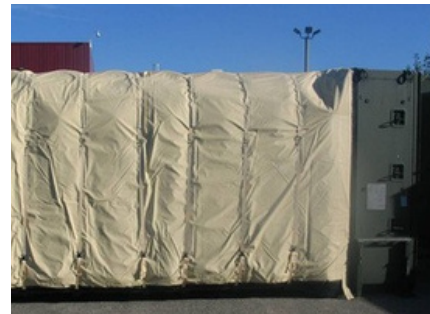
Department of National Defence (DND) AAR Mobility Systems