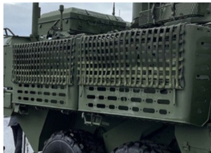
GDLS Lockable Net