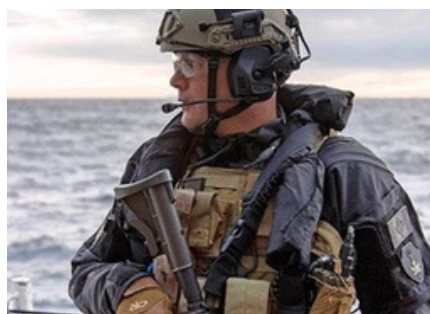
Canadian Special Operations Forces Command (CANSOFCOM) Hammerhead Tactical PFD for MSERT