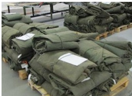
Department of National Defence (DND) - Land Forces R&O of Soft-Walled Tactical Shelters