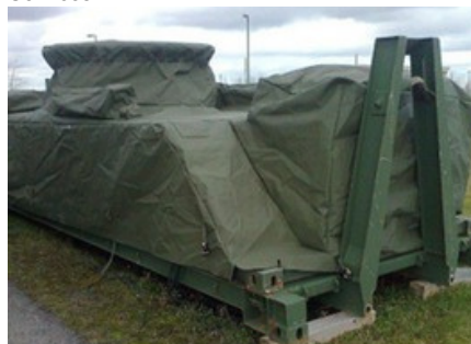
Rheinmetall Canada PSA Mooring Station Covers