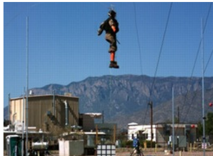
Department of National Defence (DND) - DSSPM Life Saving Device Design & Engineering Services