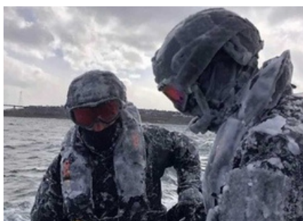
Royal Canadian Navy Hazardous Duty Tactical PFD