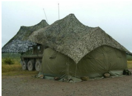
Department of National Defence (DND) Bison Tent Adapter