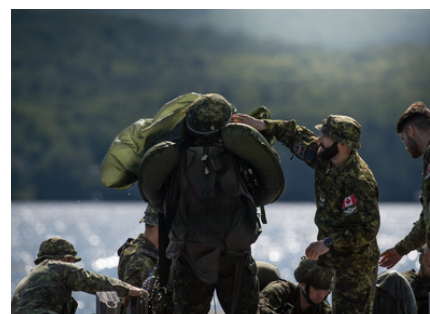
Department of National Defence (DND) - Land Forces MRO, Warehousing & Distribution of Flotation Equipment