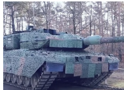
SAAB Signature Management