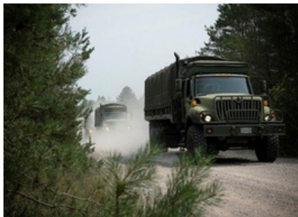
Navistar Defense Vehicle Box & Roof Box Covers for MSVS MilCOTS