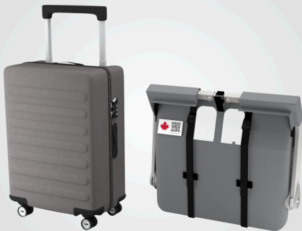
Reduced Storage Footprint