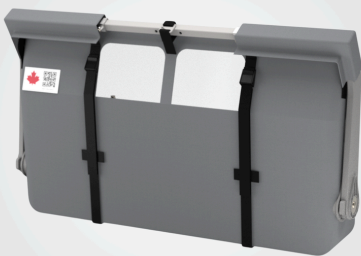
Room to Move, Even When Not in Use