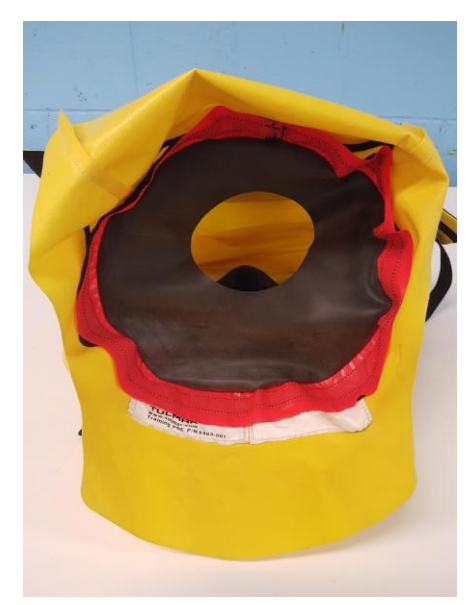
Figure 15: Neck seal oriented with opening closest to rear of hood and Velcro strip facing downwards

2. Insert the neck seal into the opening and fasten with the Velcro strip along its perimeter. Be sure that the hole in the neck seal is closest to the rear of the hood. Also ensure that the neck seal is positioned with the rubber or latex seal facing upwards and the Velcro strip downwards when installed. Installing the neck seal in the wrong direction may cause it to detach during operation (Figure 15).