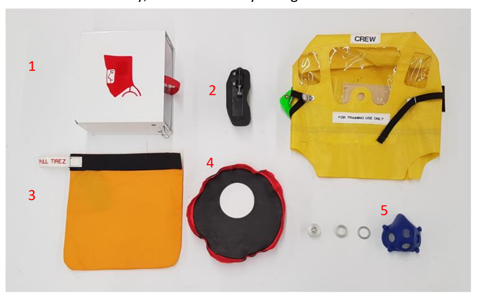
Figure 17: Numbered components

Table provided for reference only, information may change without notice.