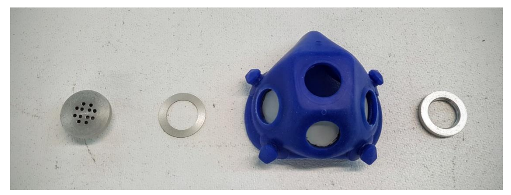
Figure 14: Nose cone assembly sorted from outermost to innermost components

1. In order to reattach the nose cone, insert the voice transmitter through the hole in the front of the hood. Place the washer on the inside, followed by the nose piece, and screw the retaining ring back into place. The correct order of the components is shown below (Figure 14). Finally, fasten the latch for each of the four straps.