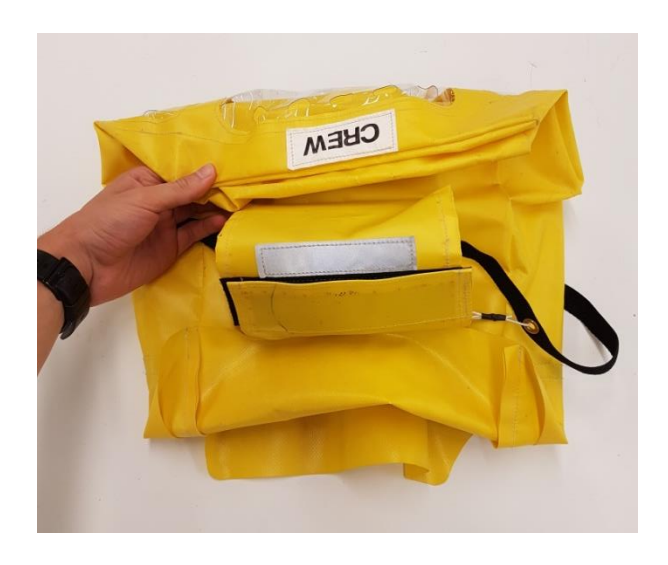
Figure 8: Folding top of PBE downwards

3. Fold the top edge of the device downwards to meet the top of the O_2 generator (Figure 8).