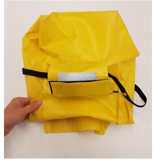
Figure 7: Folding bottom of PBE upwards

3. Fold the top edge of the device downwards to meet the top of the O_2 generator (Figure 8).