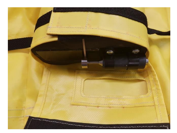
Figure 16: Activation mechanism aligned with opening in flap

3. Attach the simulated O_2 generator to the rear of the hood with the activation mechanism facing downwards, being sure to line it up with the opening on the Velcro flap (Figure 16). Close both Velcro flaps.