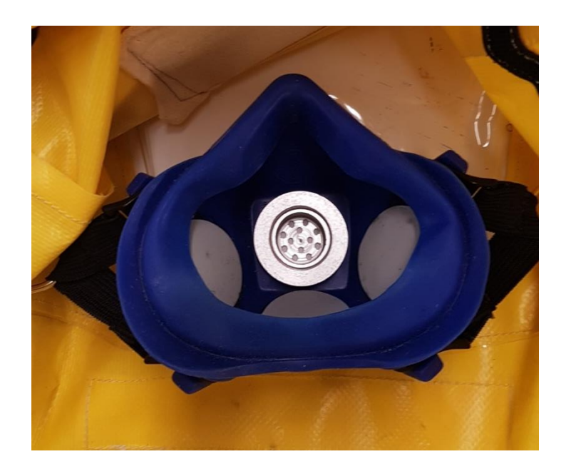
Figure 13: Nose cone attachment mechanisms