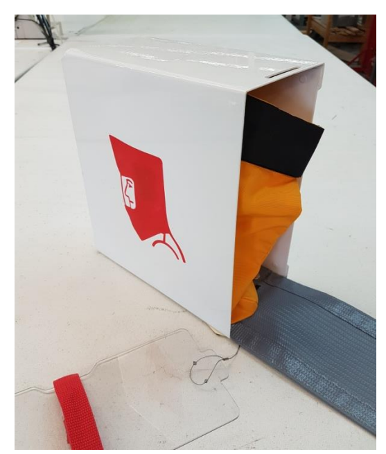
Figure 11: PBE and pouch in box assembly

6. Insert the hood and pouch into the box assembly with the opening of the pouch facing upwards, and close the flap by attaching the Velcro strip above the red tab to the mating strip at the top of the box assembly (Figure 11).