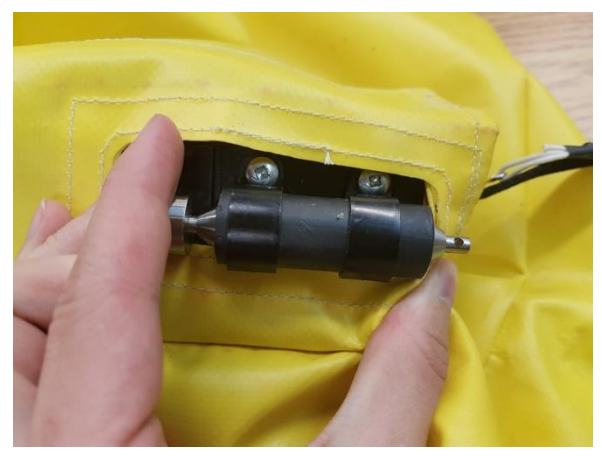
Figure 6: Activation mechanism plunger depressed to reveal hole for actuation pin reset

The activation mechanism should be reset by pressing in on the plunger (Figure 6) and reinserting the actuation pin in order to store the device in a ready to use configuration.