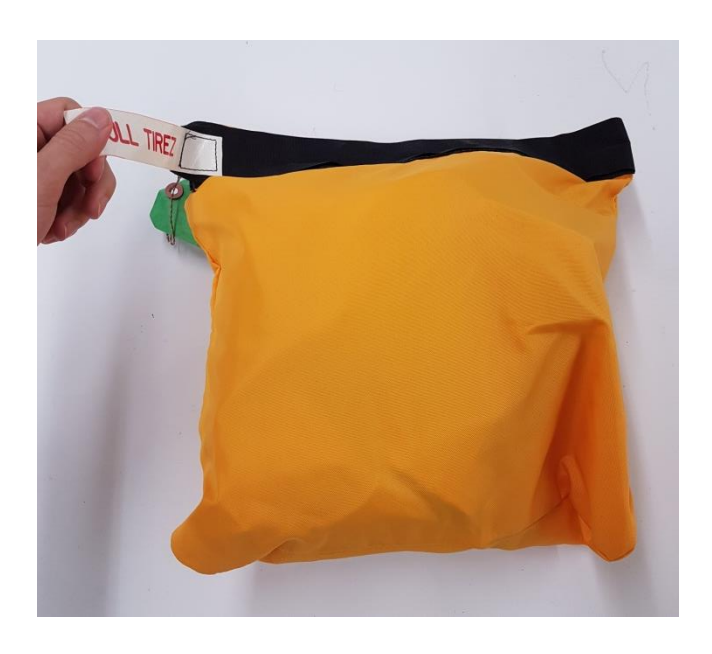
Figure 10: PBE inside re-useable pouch

5. Place the folded hood into the re-useable pouch and seal the Velcro strip (Figure 10: PBE inside re-useable pouch).