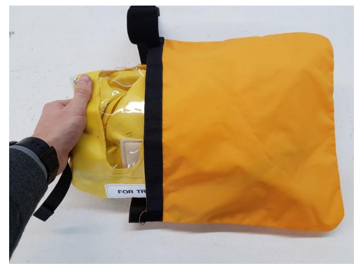
Figure 4: Removing PBE from re-useable pouch

2. If the PBE is in the re-useable pouch, open the pouch by pulling on the white 'PULL' label on the Velcro strip along the top of it, then remove the hood (Figure 4).