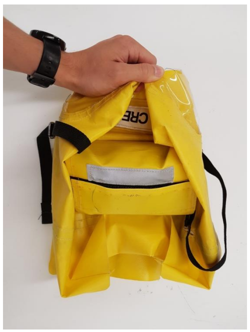
Figure 9: Fully folded PBE

4. Fold the sides of the hood inwards around the simulated O<sub>2</sub> generator (Figure 9).