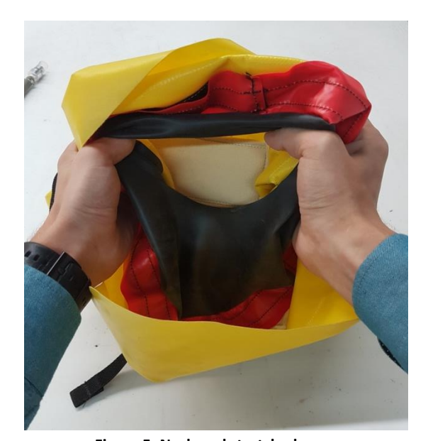
Figure 5: Neck seal stretched open

3. Hold the smoke hood in front of you, stretching the neck seal open with both hands (Figure 5).