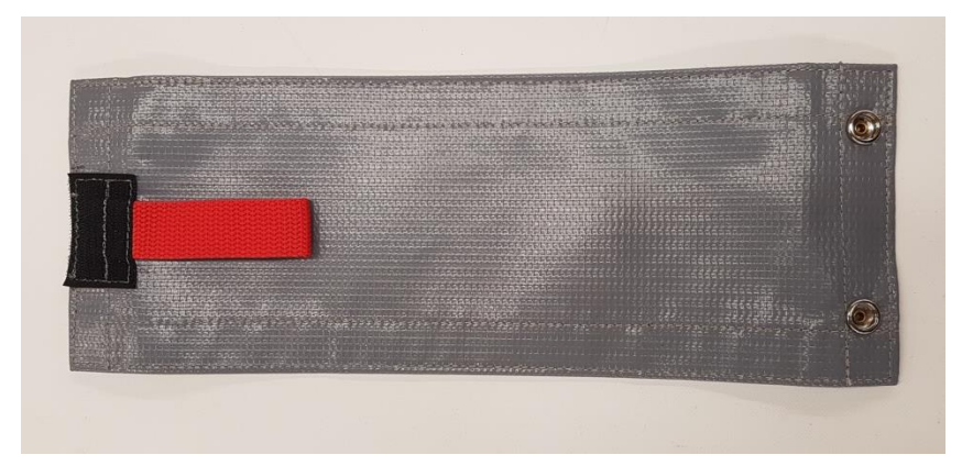
Figure 18: Flap with pull tab