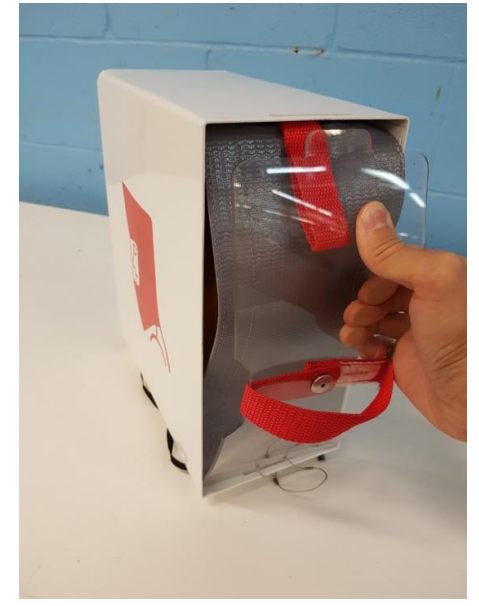
Figure 12: Inserting Lexan cover into box assembly 6438-301

7. Close the Lexan cover for the box by resting the bottom edge in the matching slot and bending the cover inwards until the upper edge can also be inserted (Figure 12).