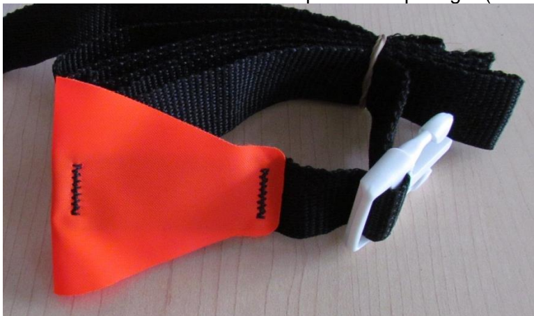
Figure 4, Pull Tab Detail.