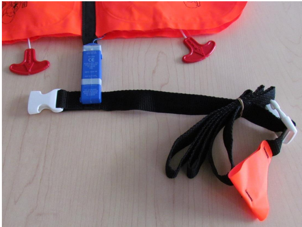
Figure 3, Battery and pull tab detail.